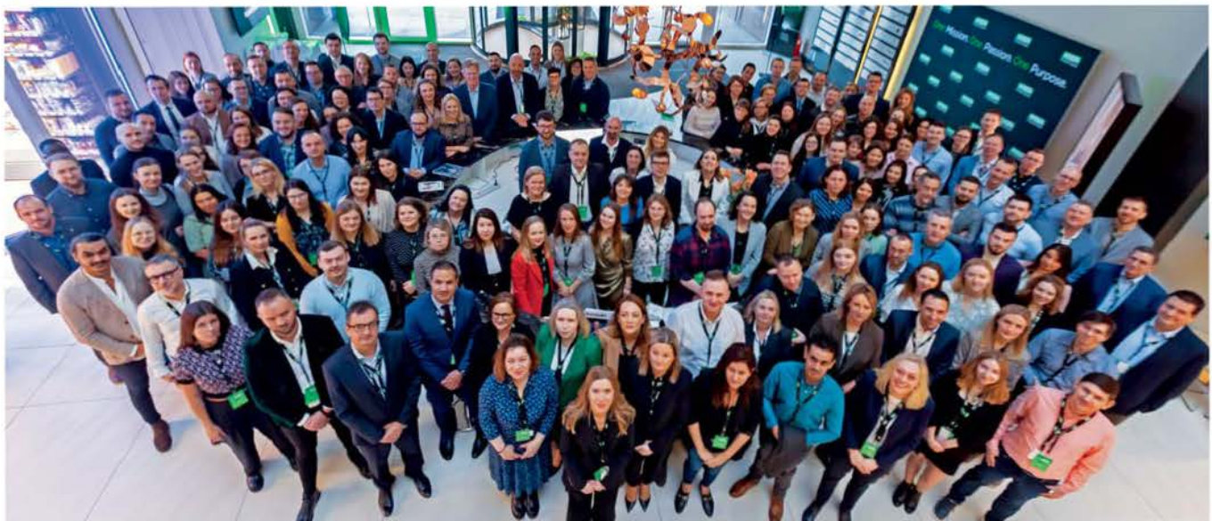
Shown above are MSA associates gathered at the company's new Global Business Services Center in Warsaw, Poland. The newly designed facility serves as a hub that centralizes a wide range of business functions that support MSA's business goals in the EMEA region.

We've also placed a keen focus on psychological safety. As THE Safety Company this should come as no surprise. Safety, inclusion and full participation at work has to encompass our associates' physical, mental and psychological well-being. These are just a few examples of how we're thinking differently about inclusive talent.