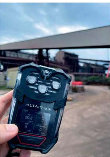
ALTAIR io4™ Gas Detector

We don't just produce products—we invent, we innovate, and we create next generation safety technologies. That means taking our industry-leading products and enhancing many of them with technology and AI-powered systems. These are products that connect and detect for safety and for sustainability, helping to make work safer, easier and more productive.